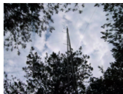
KK4GQ Repeater Tower located in Fayetteville

The Fayette County Amateur Radio Club has teamed up with Fayette County ARES and WX4PTC to provide a network of five outstanding VHF/UHF repeaters in our area. These repeaters effectively serve all of the south Metropolitan Atlanta area and include the following: