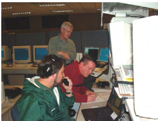
KD4YDC, AG4ZR and KI4DEM working at the WX4PTC radio station at the NWS office.